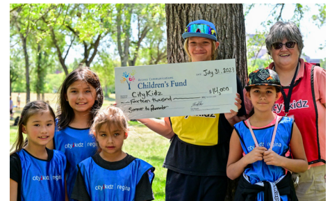
Children's Fund donation to CityKidz.

To learn more about the criteria for funding and to fill out an application form, visit myaccess.ca/childrensfund .