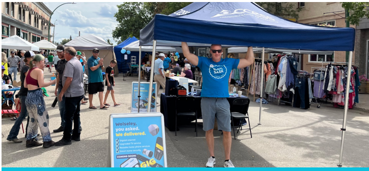
Wolseley 125th Anniversary Trade Show

The Town of Wolseley was the place to be this summer as the town hosted a weekend-long celebration in honour of its 125th anniversary. Access Communications took part in the town's trade show and parade, giving away some swag and letting visitors know all about our not-for-profit co-operative. Access is soon launching new services in Wolseley, including AccessHyperSpeed 1 Gig and AccessNexTV Stream, and we know the community is excited.