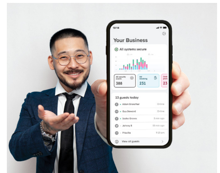
AccessBusiness Smart Wi-Fi is here.

This year Access has also launched gigabit internet services, streaming television, phone and security monitoring for residential and business customers in many communities, including Birch Hills, Cochin, Hague, Imperial, Nokomis, Osler, Simpson, and Young. And this fall, we're launching these same services in Aberdeen, Bruno, Dundurn, Glaslyn, Govan, Muenster, Strasbourg, and Wolseley. For the best pricing and promotion in your area, visit myaccess.ca/deals .