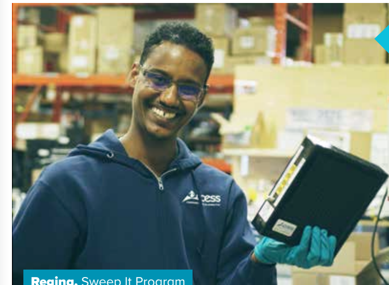
Regina, Sweep It Program

Access believes in raising awareness and embracing sustainability in everyday operations. Our employees lead the charge and have implemented many changes, such as paperless initiatives (for billing and pay statements), and low energy light fixtures. We also recognize National Waste Reduction Week in October to raise awareness. Our warehouse continues to run its Sweep It program to recycle computers, TVs, or anything with a plug (dropped off at our local SARCAN).