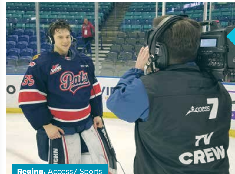
Regina, Access7 Sports

Access Communications knows the province has a story to tell. That’s why we’ve invested millions to deliver our Access7 community channels to nearly 100 communities across Saskatchewan. Each Access7 channel has its own local shows and programming celebrating culture, lifestyle, events, and sports. Thank you to all our AccessTV subscribers whose support makes it possible!