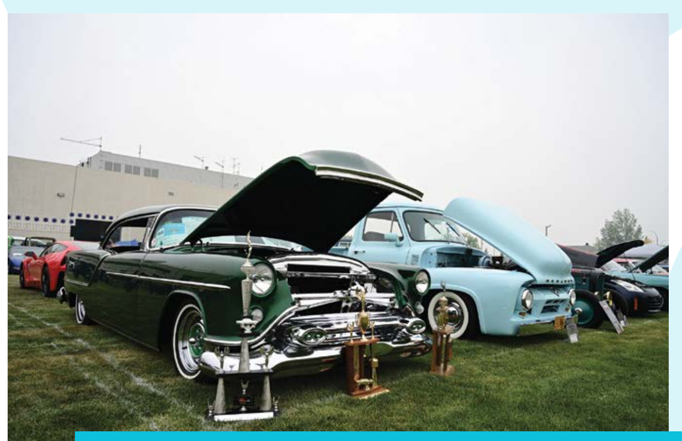
The threat of rain and smoke in the air, didn't tarnish the shine of every vehicle in this years show.

Thank you to everyone who came out, all the sponsors, and volunteers for supporting this incredible event.