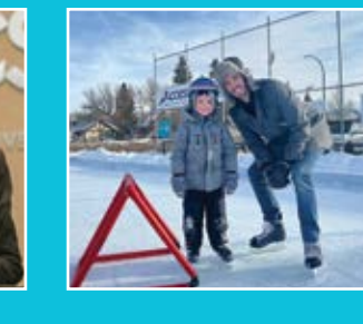
Access Communications Community Rink opens for the season, providing free skates and helmets to community members.