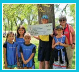
Access Communications Children's Fund eclipses $3 million mark in funds donated.