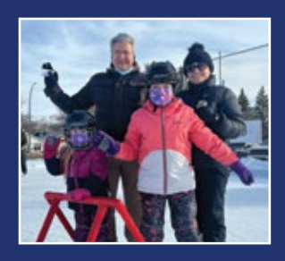
The Access Community Rink opens for the season, providing free skates and helmets to community members.