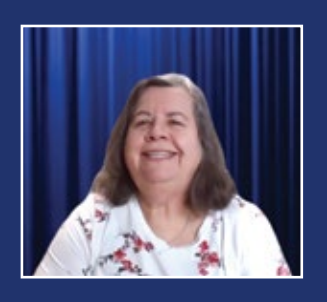
Access hosts a virtual Annual General Meeting for members.